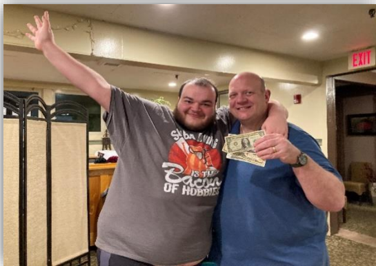
First Place went to team: “Winners”!