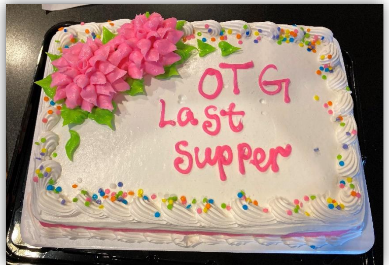
Dawn brought a cake to make it a proper farewell