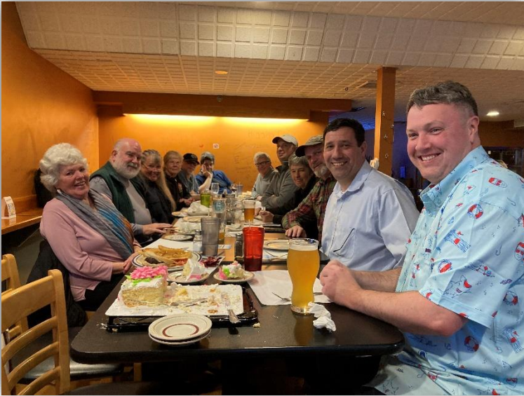
Enjoying dinner at our usual spot