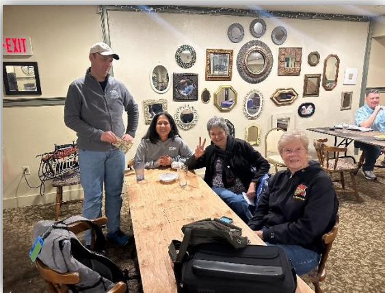
Third Place went to team: “The Filipinos”