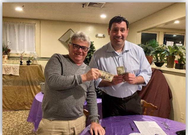
Second Place went to team: “Team Name”