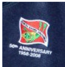
Pictures of NSF jacket and logo. Right above: jacket shell side Right: jacket fleece side

Contact Mia Peluso to place your order or for more information at 781-727-1641.