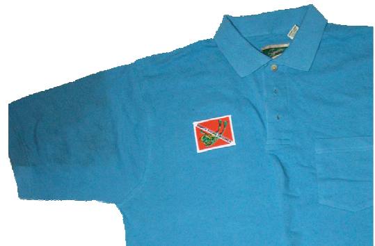
Polo shirts, hats, lapel pins and patches or magnets