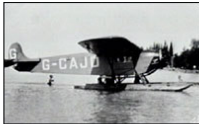
The Fokker Universal

"We used that information, the weather report, and ... more sophisticated equipment. We knew right where we wanted to start [searching] this year – and talk about being right on target."