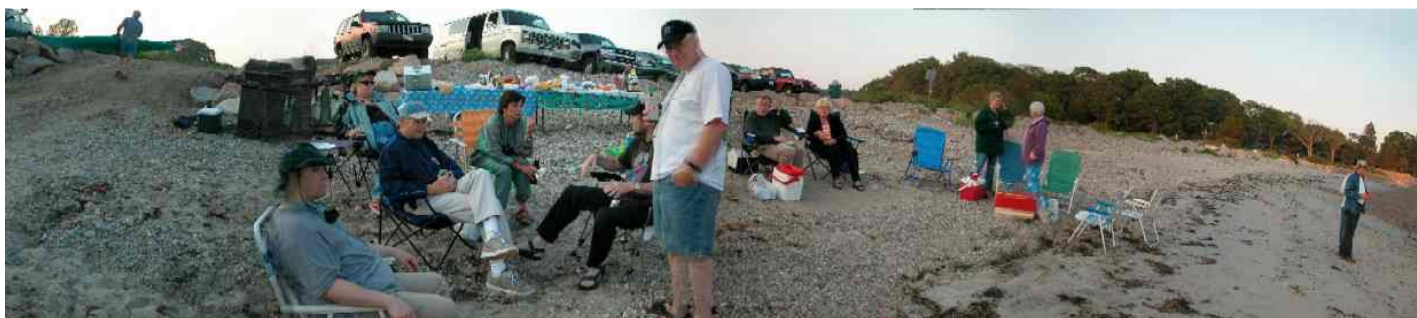
Group photo at Beach Meeting on June 24 , White's Beach, Manchester