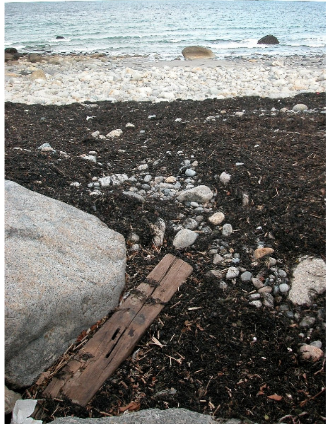
Old Garden Beach looking more like Pebble Beach. Sand washed from beach means shallower depths for diving.