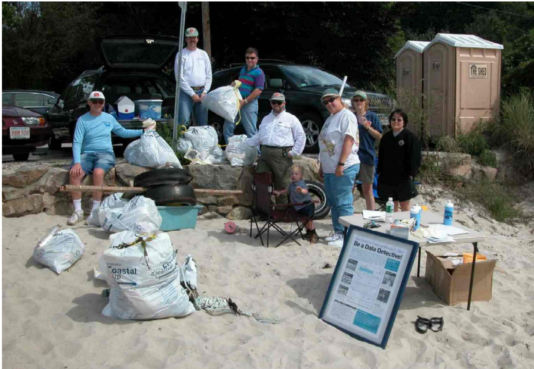
Above: some of the people who helped clean up Niles Beach on Sept 11.