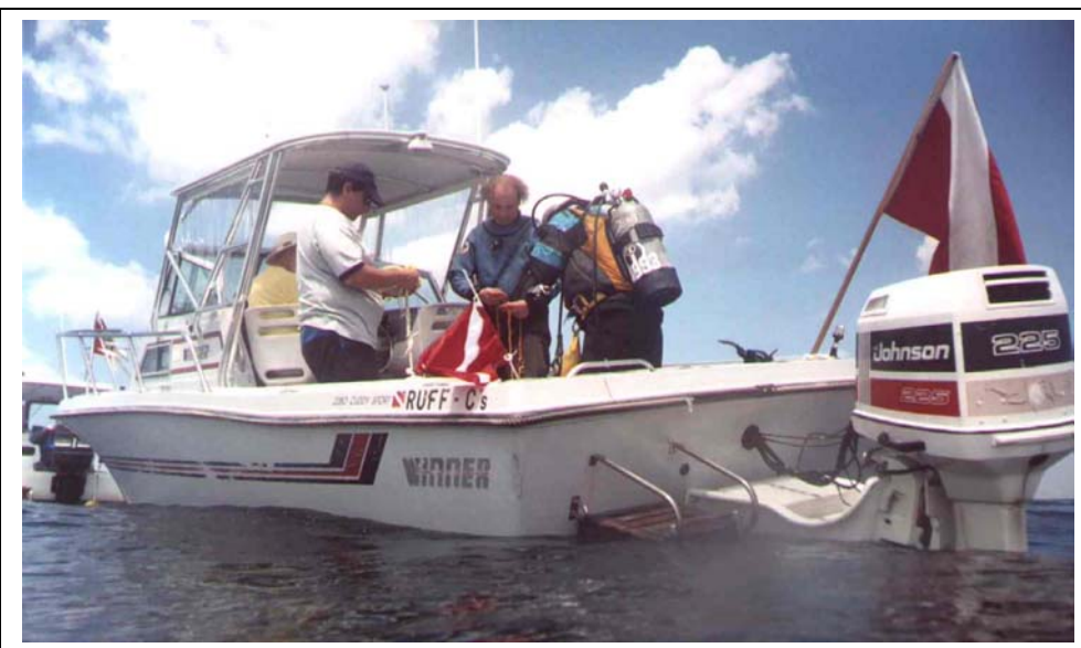
Transect Dive with the South Shore Neptunes Dive Club on July 6