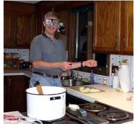
Reason 57: No more tears!