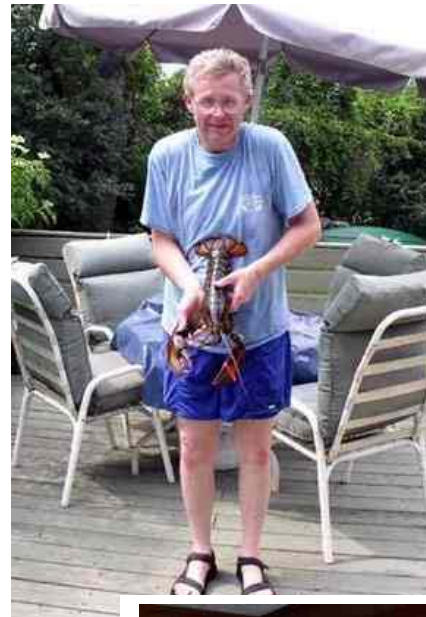
Reason 38: Dinner for two.