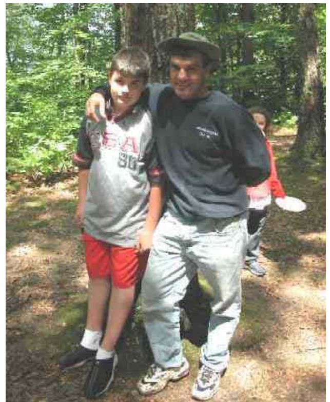
A couple of Pauls spending some time together (Daryl Findlay)

All who attended had a great river adventure with friends and will surely return again next year.