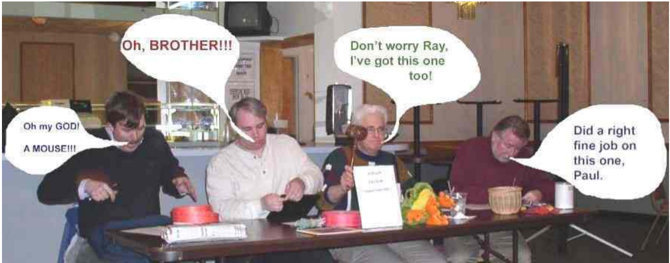
“Brain Trust” - Our club officers at work on a recent Thursday night