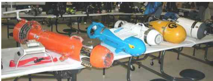
Several diver propulsion vehicles (dpvs) displayed at Wrecks

For enthusiasts and wreckers who needed more, the MWDC reserved a room at La Cantina Restaurant for a 'Meet the Speakers Party' following the convention. Pizzas, salads and beer mixed with conversations of local wreck divers' own adventures in extreme environments. An apt ending for a program billed as "A Show for Divers by Divers."