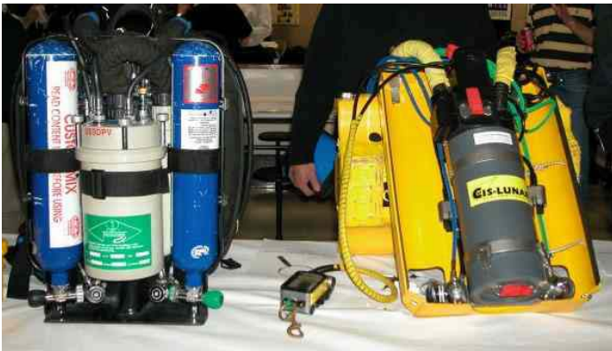
Insides of a couple of rebreathers at Wrecks