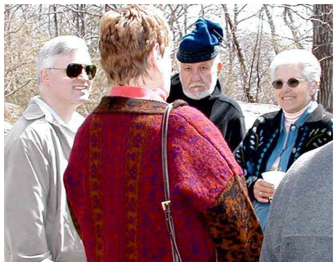
Talking over "Days of Old"