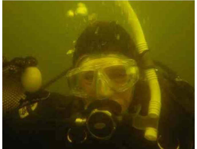
I found one!!