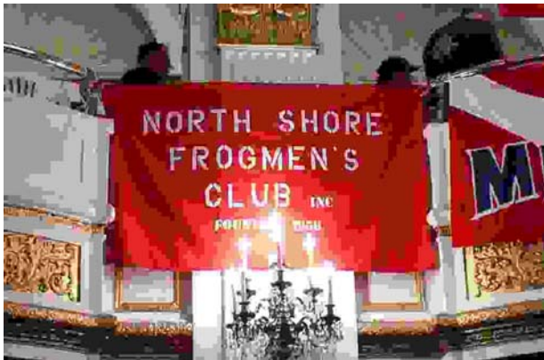
Photo of NSF banner hung above exhibit floor at Sea Rovers, as seen from the floor