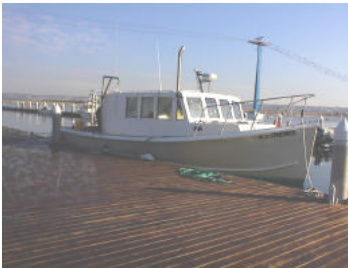
R/V Extremis, pining away for her New England waters as she sits, forlorn, near San Diego's Mission Bay

ONE BROWNIE APPROXIMATELY EQUIVALENT TO 1/2 HOUR OF SURFACE INTERVAL.