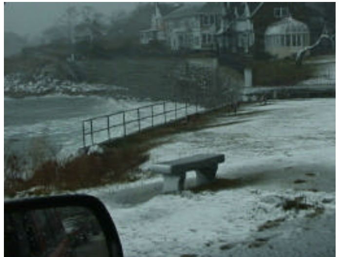
...of course, there are limits. January 13 was a day best spent remembering yesterday's dive, and planning for next week.