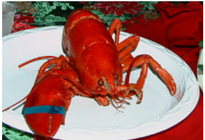
Not exactly commensalism, part II: The locomotion derived by this lobster from this plate, is not the kind he's looking for. Dinner at the 2001 NSF Banquet was exceptional!

With a new year upon us, here's hoping that divers everywhere take symbiosis one more fin kick! Sea Ya!