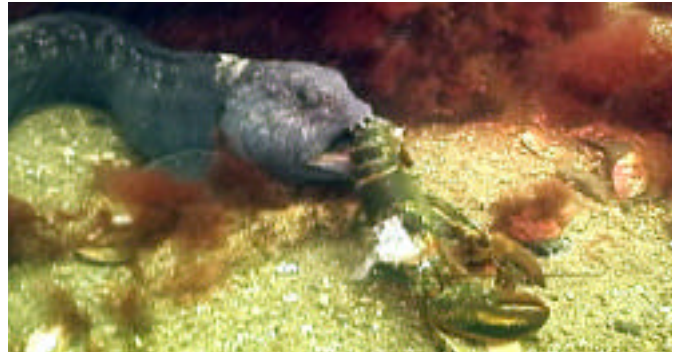
Not exactly commensalism: a lobster "hides" in the jaws of a wolf fish

Parasitism: One very evident example of parasitism that we see while diving would be the copepods attached to the brows of squirrelfish. These, being attached to the outside of the host, are known as ectoparasites. Most of us have seen this phenomena from the beginning of our diving careers. These organisms are directly feeding from their hosts' bodies.