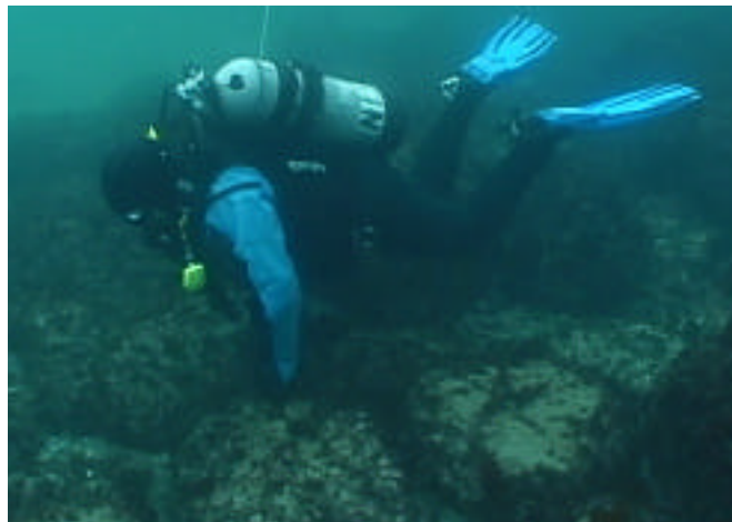
Cold weather, schmold weather! It takes more than a little nip keep Froggies out of the water. This dive took place on Jan 12...