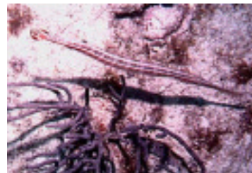
Trumpet Fish, Ft. Lauderdale

Please set this date aside on your calendar.