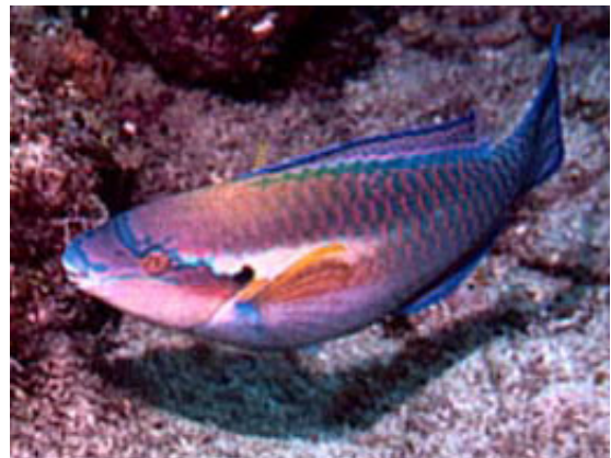
Parrot Fish, Ft. Lauderdale