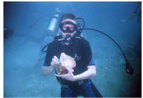
"One more conch like this one and we can have dinner!"