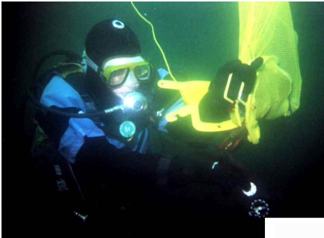
"Listen carefully, drop the bag and nobody gets hurt!"