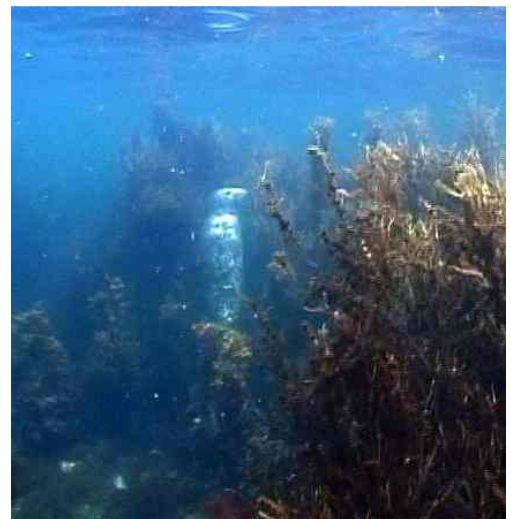
Above right and right, "Seals in the mist"

Photos on this page counterclockwise from top are from: Bob Michelson, Dave Smith and Daryl Findlay