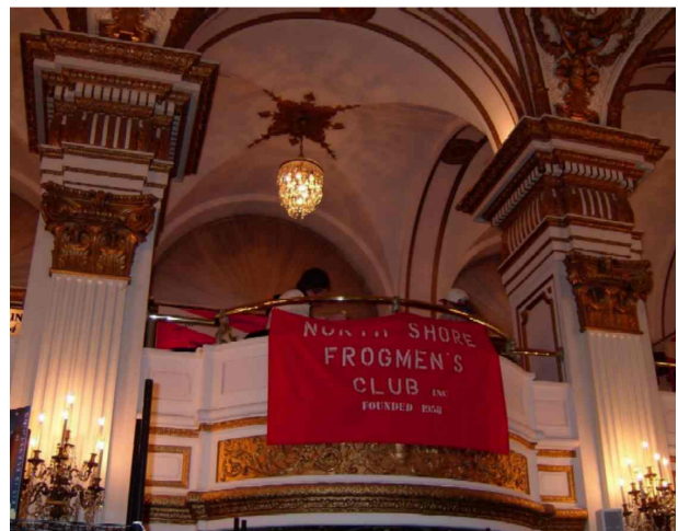
Above: two views of the NSF booth at Sea Rovers