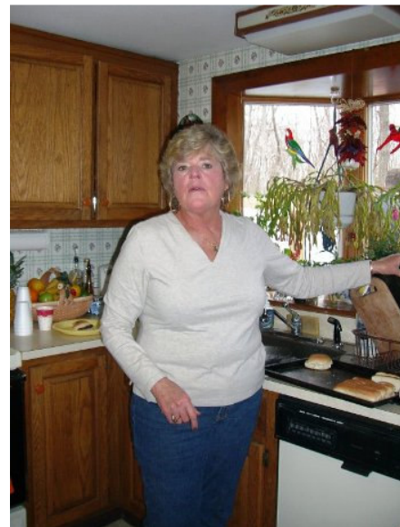
Dodie, above, the hostess with the mostest