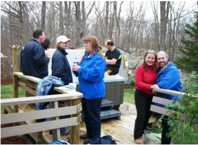
The hot tub was popular with some folks!

Pictures below are courtesy of Paul Sauvageau.