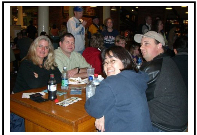
This group enjoyed the food and company at Faneuil Hall Marketplace before going to the Aquarium to see Deep Sea 3D on April 14.