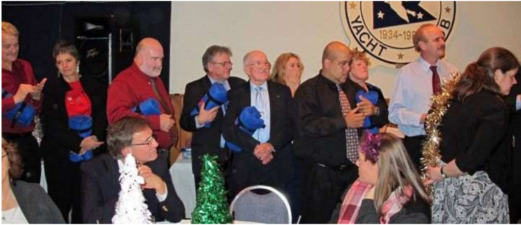
Members/Divers of the month line up for their awards.