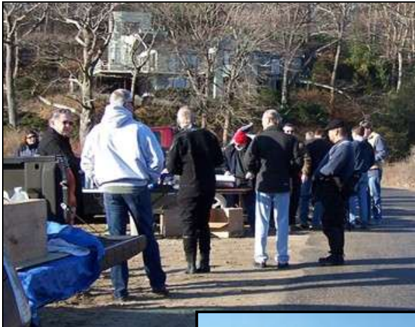
Left: the group ready to get ready to go diving.