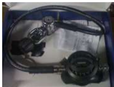
Apex XTX50 regulator donated by Undersea Divers

Timing: People start showing up about 10 or 11. Food starts coming off the grill about noon. Stay as long as you want, especially if the weather cooperates. The people setting up for the picnic will need to arrive early enough to opt for the best spot, about 8AM.