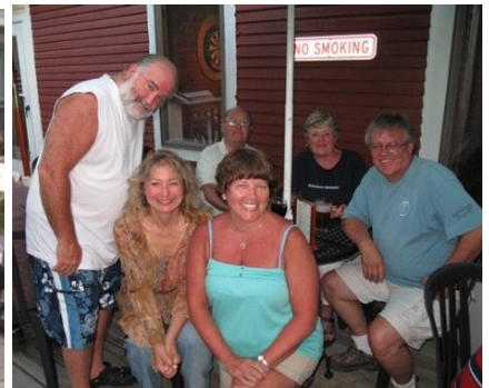
Dinner out on Friday night at MacLaomainn's Scottish Pub in Chester, VT