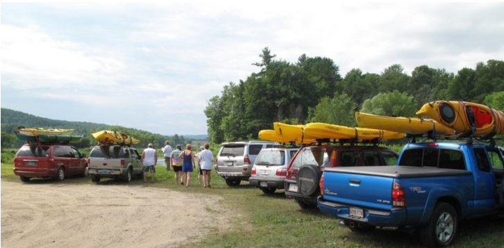
14 people in 13 kayaks went for a nice little paddle on Sunday. Lunch in the river was cool!