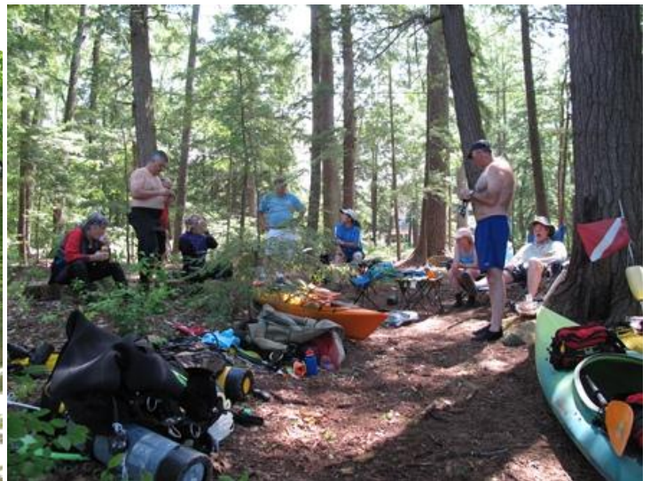
Group taking nourishment in preparation for dive #2