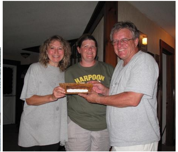
Saturday night spike presentation