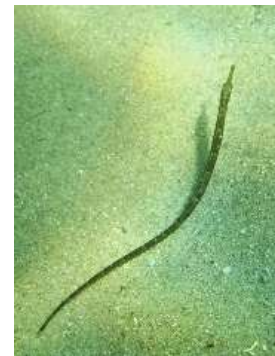
Pipefish, Pebble Beach, Sept 2010